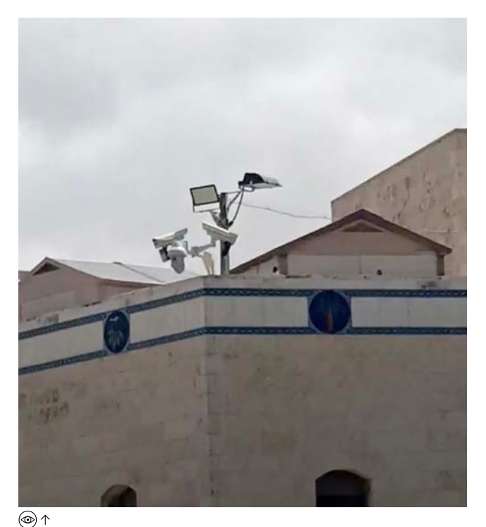
Cameras, lights and ambient sound detection mounted on a rooftop in H2.

system in 2004.<sup>133</sup> In the immediate aftermath of the second intifada and onwards, the Israeli security apparatus has been developing its technological capabilities rapidly and paired it with extensive deployment and use of CCTV infrastructure in the OPT.<sup>134</sup>