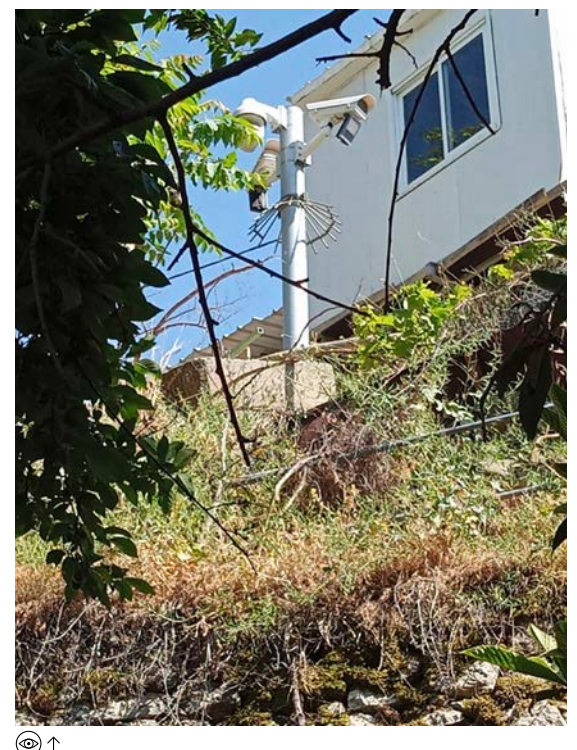
Surveillance tower near alternative path around no-go zone in Tel Rumeida

Ahmed explained that there is a way to bypass the restricted parts of Shuhada Street, which requires hiking behind buildings and up a hilly dirt road. He described this route as especially challenging for older individuals, particularly in the winter. According to OCHA, the detour turns a five-minute walk of 100m to 200m into a walk of around 3km.<sup>192</sup> This makes going to certain parts of the neighbourhood unnecessarily burdensome. As Amnesty International researchers observed during repeated visits to the area, even this path is covered by surveillance towers and under the constant purview of Israeli military personnel. Detours such as this are just one aspect of an environment that is being made more arduous and difficult to move in, contributing to the unbearable conditions faced by Palestinians in the area. Combined with some 20 checkpoints, the increased surveillance, harassment and violence at the hands of settlers and Israeli security forces render everyday life extremely difficult for Palestinians.193