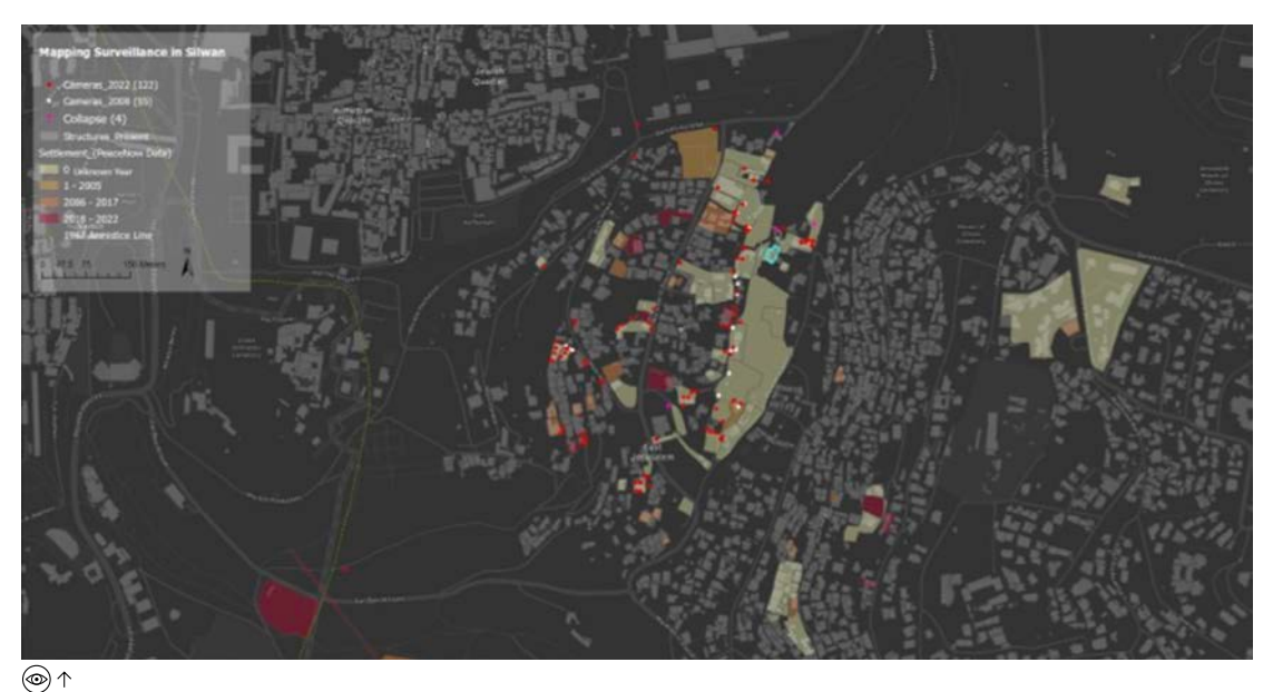
Surveillance deployments in Silwan over time (courtesy of Dr Ariel Caine). © Amnesty International

Palestinian photojournalist Faiz Abu Rmeleh, generated a map for Amnesty International based on their survey, demonstrating the intensification of surveillance over time, comparing devices present in 2008, prior to the court petition by residents of Silwan, and again in 2022, over a decade following the petition.<sup>256</sup> This data demonstrates a clear increase in surveillance nodes, just as excavation sites have expanded. The combination of settlement activity and the increase in surveillance equipment erected by Israeli settlers and security forces are part of an intentional strategy to create a coercive and hostile environment to minimize Palestinian presence in areas of strategic importance in occupied East Jerusalem, such as Silwan, in order to establish and consolidate Jewish domination and control over these areas.<sup>257</sup>