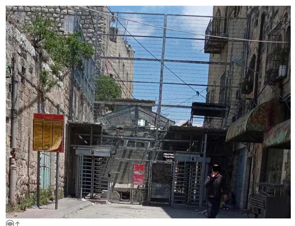
Checkpoint 56 in Hebron City.

recognition at carousels at checkpoints within the city, without any explanation or reason provided.<sup>166</sup> There are typically about 10 to 15 cameras at checkpoints.<sup>167</sup> By Checkpoint 56 in H2, a towering barrier features two turnstiles, Amnesty International researchers observed at least 24 cameras on the outside. This checkpoint is where Palestinians interface most intensely with Israeli security forces, and the limitations to their rights.<sup>168</sup> Many Palestinians rely on passage through the checkpoint to access most, if not all, of goods and services, work, education, family life, and healthcare. It is here where witnesses describe coming face to face with a new facial recognition system, Red Wolf.