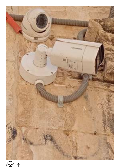
(2) 11 HIKVISION P/T/Z Cam mounted above Grundig bullet cam.